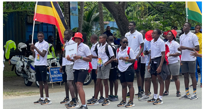
Team Uganda at the Commonwealth Youth Games 2023 in Trinidad&Tobago preparing for the closing ceremony