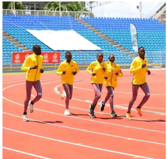
Ugandan athletes warming-up at the Commonwealth youth games in Trinidad and Tobago

The World Beach Games were canceled by the hosts, Indonesia. No immediate venue could be identified. By the time of cancellation, the Basketball 3 x 3 women had qualified and had expected to qualify other sports like beach handball and wrestling.