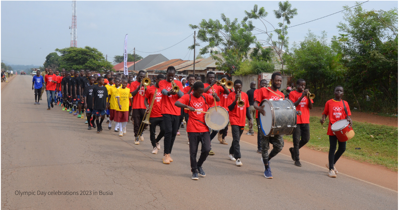
Olympic Day celebrations 2023 in Busia

to show the role sport can play in social protection and addressing mental health in refugee communities going forward.