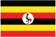
Republic of Uganda