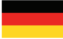
Federal Republic of Germany