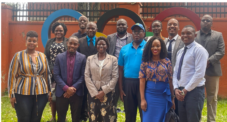
Top left: UOC President and Secretary General share gifts with the French Ambassador to Uganda during his NOC visit. Bottom left: Group photo between the UOC and USPA. Right: A training workshop on sustainability essentials in sports held at the UOC offices.