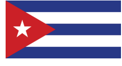
Republic of Cuba